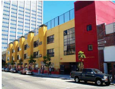
Tenderloin Community School San Francisco Unified School District

School districts throughout Northern California are discovering the power and savings of a virtual infrastructure. Energy savings and ease of management are just a couple of the benefits that are realizing significant Return on Investment (ROI) for a number of districts.