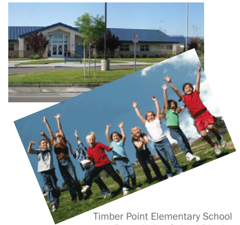
Timber Point Elementary School Byron Union School District

Byron Union School District needed a cost-effective and scalable solution to replace outdated and non-functioning PCs. Students did not have adequate access and the lack of reliable computer systems and availability issues discouraged teachers from building computer access into their lesson plans.